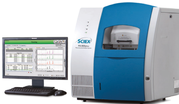
The PA 800 Plus Pharmaceutical Analysis System